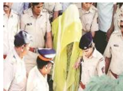
Fig 2: Mrs IM produced in the court