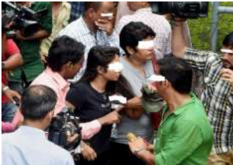
Fig 5: Media covering every bit of sensational story.