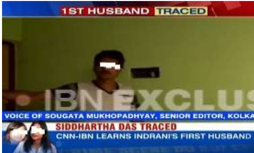
Fig 3:Mr SD, the first husband.