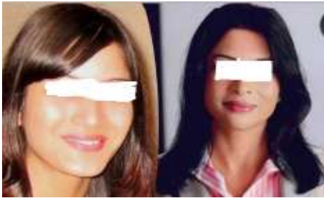
Fig 4: Mother and daughter.