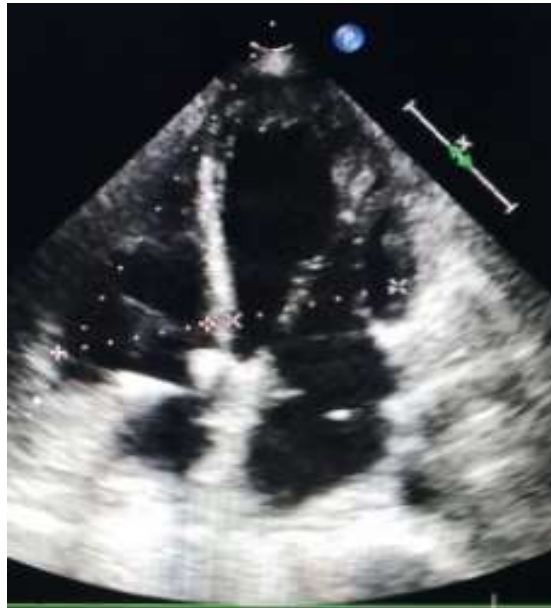
Figure 4: Post-operative TEE free of residual mass.

The post-operative period was marked by a nosocomial pulmonary infection with bilateral pulmonary embolism. Patient was symptom free 8-month post-operation, with no sign of tumor recurrence or mitral valve dysfunction in trans-thoracic echocardiography ( fig 4 ).