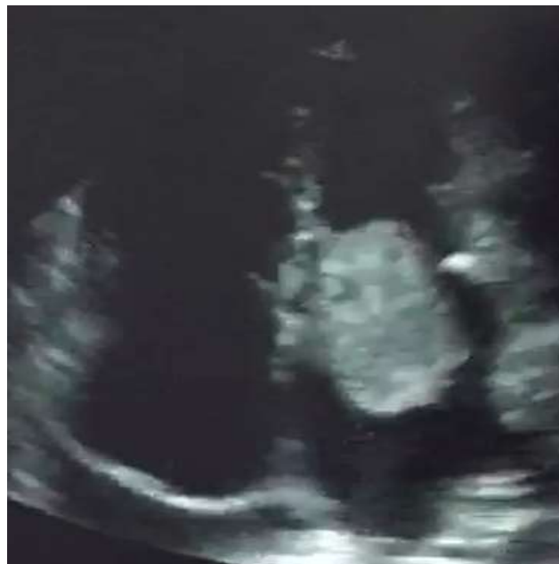
Figure 2: TEE revealed an echogenic mobile mass in the left atrium with attachment to the atrial septum, prolapsing into the left ventricle, causing functional mitral valve stenosis.

Biauricular, right ventricular and tricuspid valve annulus dilatation with pulmonary arterial hypertension were also noted. The pericardium was the site of minimal effusion. The left ventricular ejection fraction was 52%.