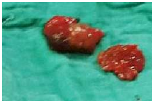
Figure3: Macroscopic appearance of surgical specimen.

She underwent urgent heart surgery, during which a friable tumor attached by a sessile base to the anterior atrial septum was removed ( fig3 ). The mitral valve was healthy and a tricuspid annuloplasty was put in place.