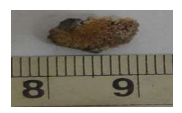
Figure- 3 The expelled renal stone

DOI: 10.18535/rajar/v1i7.01 www.rajournals.in