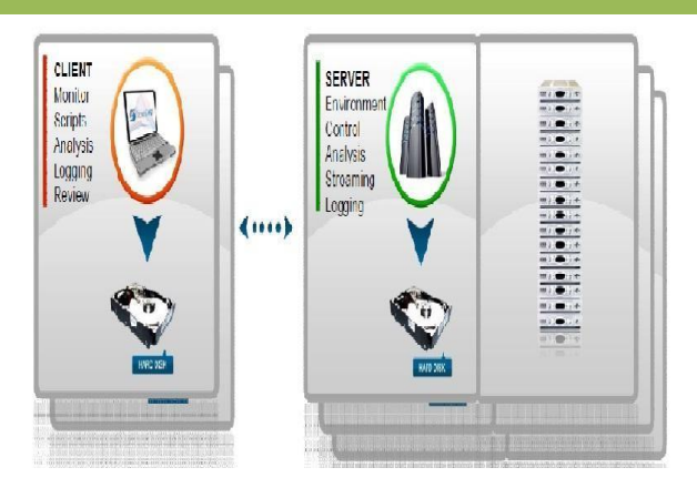
Figure 1: Currently Adopted methodology Working:

The Set Top Boxes to be tested are installed in a frame/rack with multiple slots. Each slot in the frame/rack can be controlled individually so the same test can be run on many Set top boxes or different tests cases can be run simultaneously on different set top boxes (this approach will be useful for high throughput of functional tests). The server controls the communication with the devices under test, for instance sending Infrared commands to the set-top boxes under test and capturing the audio/video output of each box for further analysis. The client machine is used by the test engineers. It contains all the test scripts which have been created for the particular STB under test. The test engineers configures the test frame/rack with the sequence of tests cases to be run on each set-top box, and the client machine will gather and store all the relevant logging information during the test run. When the test